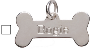
bone "luscious" tag