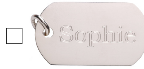
"i belong to" Tag