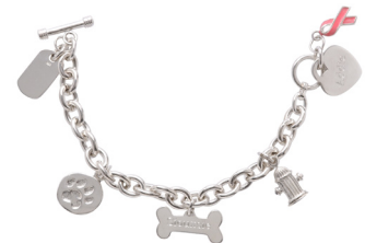
five charm bracelet