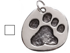
Paw "actively" tag