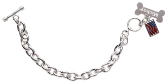
one charm bracelet