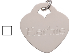
heart "felt" tag