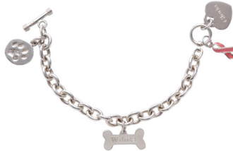
three charm bracelet